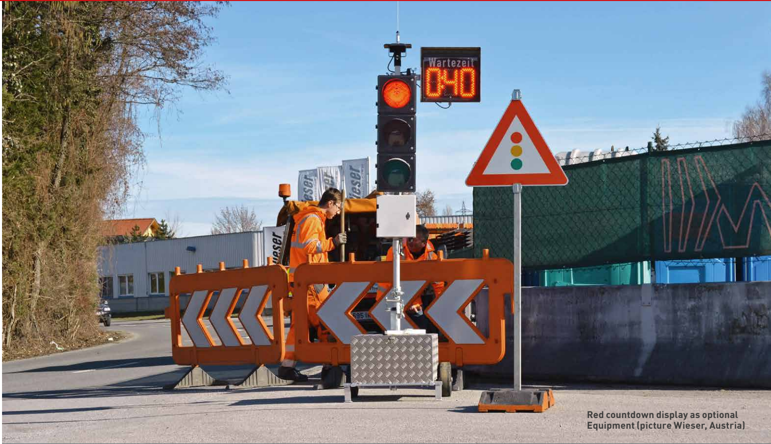
Red countdown display as optional Equipment